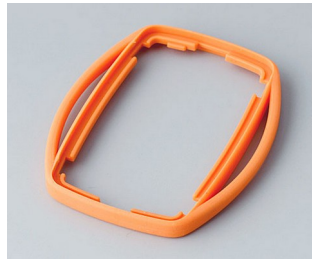
B9002753 Intermediate ring ES TPE orange