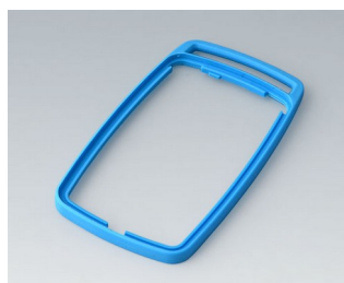
B9006705 Intermediate ring EL TPE blue