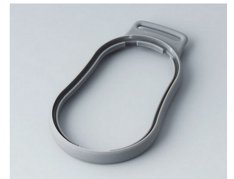
B9004308 Intermediate ring DM TPE volcano