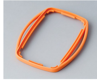
B9004753 Intermediate ring EM SEBS (TPE) orange