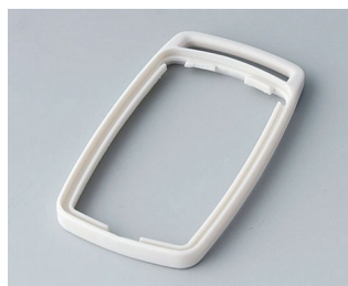
B9002707 Intermediate ring ES TPE off-white RAL 9002