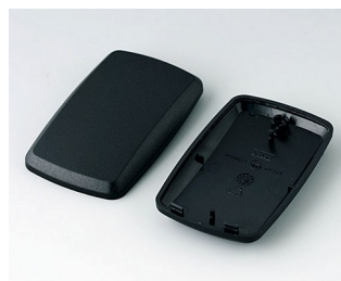
B9004856 Bottom and top part EM PMMA (IR) (UL 94 HB) black RAL 9005 68x42x18mm