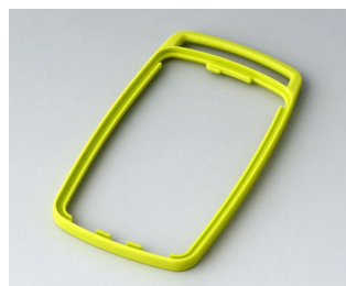
B9004704 Intermediate ring EM TPE green