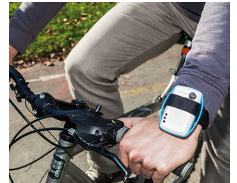
Mobile air quality monitoring