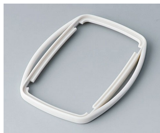
B9006757 Intermediate ring EL TPE off-white RAL 9002