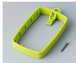
B9004784 Intermediate ring EM, high SEBS (TPE) green