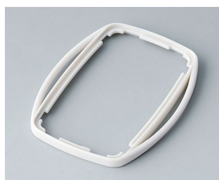
B9004757 Intermediate ring EM SEBS (TPE) off-white RAL 9002