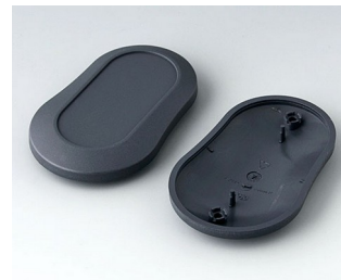
B9006908 Bottom and top part DL ABS (UL 94 HB) lava 84x53x19mm