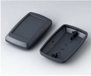
B9006828 Bottom and top part EL ABS (UL 94 HB) lava 78x48x26mm