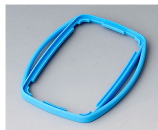
B9004755 Intermediate Ring EM TPE blue