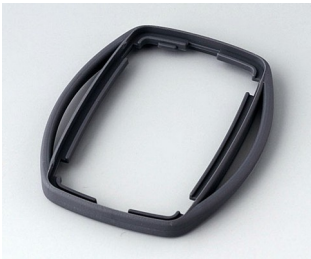
B9002752 Intermediate ring ES TPE lava