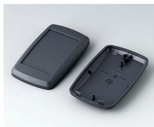
B9004808 Bottom and top part EM ABS (UL 94 HB) lava 68x42x18mm