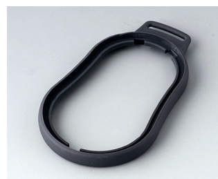
B9006302 Intermediate ring DL TPE lava