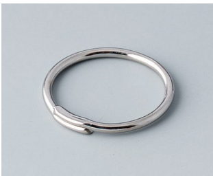
A9164001 Key ring Steel nickel-plated 20,5mm