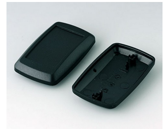
B9006816 Bottom and top part EL PMMA (IR) (UL 94 HB) black RAL 9005 78x48x24mm