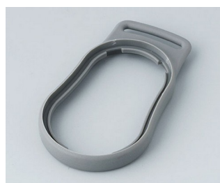
B9002308 Intermediate ring DS TPE volcano