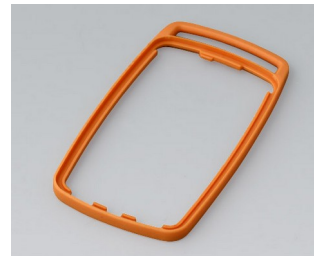
B9004703 Intermediate ring EM TPE orange