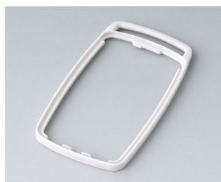
B9004707 Intermediate ring EM TPE off-white RAL 9002