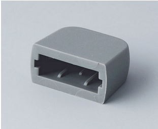
A9320008 USB end cover TPE volcano