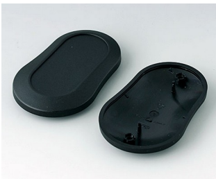
B9006906 Bottom and top part DL PMMA (IR) (UL 94 HB) black RAL 9005 84x53x19mm