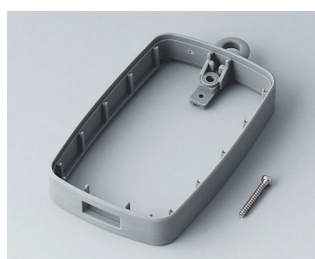
B9004798 Intermediate ring EM, USB type A TPE volcano