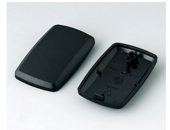
B9002856 Bottom and top part ES PMMA (IR) (UL 94 HB) black RAL 9005 52x32x15mm