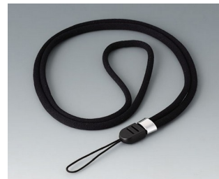
B9100063 Carrying strap, textile lanyard black 860mm