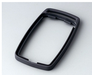
B9002702 Intermediate ring ES TPE lava