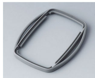
B9006758 Intermediate ring EL TPE volcano