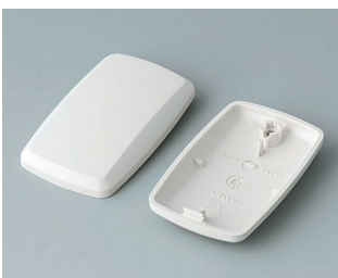
B9002857 Bottom and top part ES ABS (UL 94 HB) off-white RAL 9002 52x32x15mm