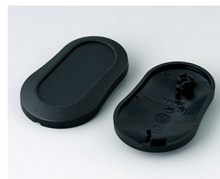
B9002906 Bottom and top part DS PMMA (IR) (UL 94 HB) black RAL 9005 51x32x13mm