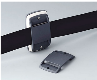
B9106108 Strap eyelet EL ABS (UL 94 HB) lava