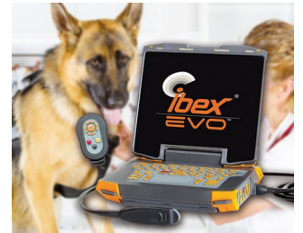
Portable ultrasonic device for veterinary medicine