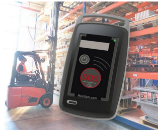
Mobile Security Solutions for workers