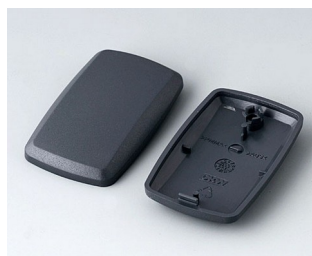
B9002858 Bottom and top part ES ABS (UL 94 HB) lava 52x32x15mm