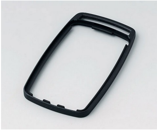
B9004709 Intermediate ring EM ABS (UL 94 HB) black RAL 9005