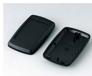
B9004806 Bottom and top part EM PMMA (IR) (UL 94 HB) black RAL 9005 68x42x18mm