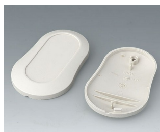
B9004907 Bottom and top part DM ABS (UL 94 HB) off-white RAL 9002 70x44x16mm