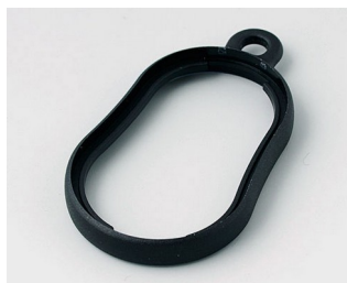
B9002356 Intermediate ring DS PMMA (IR) (UL 94 HB) black RAL 9005