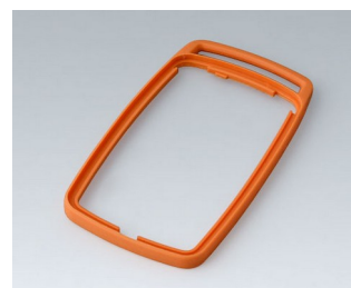
B9006703 Intermediate ring EL TPE orange