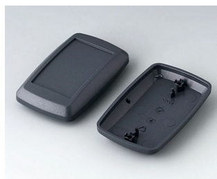
B9006818 Bottom and top part EL ABS (UL 94 HB) lava 78x48x24mm