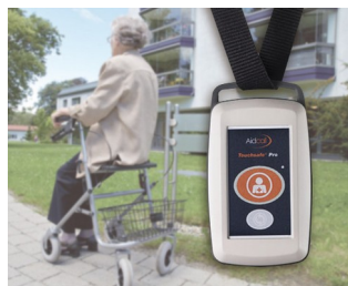
Radio transmitter for emergency call system for patients