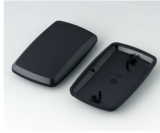
B9006856 Bottom and top part EL PMMA (IR) (UL 94 HB) black RAL 9005 78x48x20mm