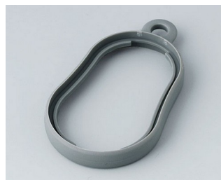
B9002358 Intermediate ring DS TPE volcano