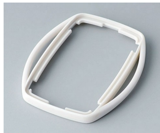
B9002757 Intermediate ring ES TPE off-white RAL 9002