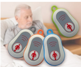
Radio paging systems