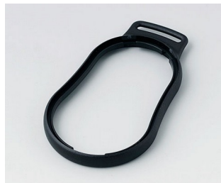
B9004306 Intermediate ring DM PMMA (IR) (UL 94 HB) black RAL 9005