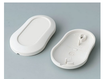
B9002907 Bottom and top part DS ABS (UL 94 HB) off-white RAL 9002 51x32x13mm