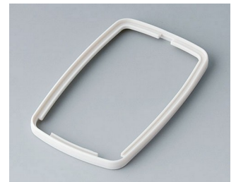
B9006787 Intermediate ring EL SEBS (TPE) off-white RAL 9002