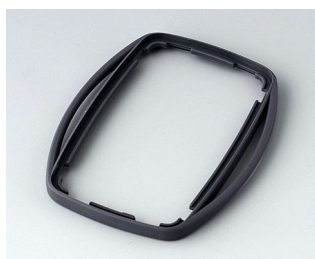
B9004752 Intermediate ring EM TPE lava