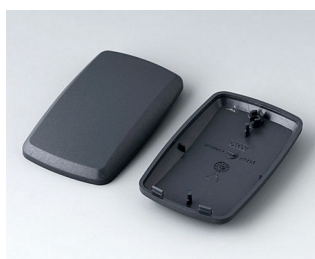
B9004858 Bottom and top part EM ABS (UL 94 HB) lava 68x42x18mm