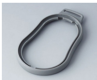
B9006308 Intermediate ring DL TPE volcano