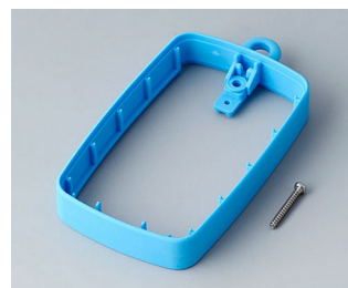
B9004785 Intermediate ring EM, high TPE blue