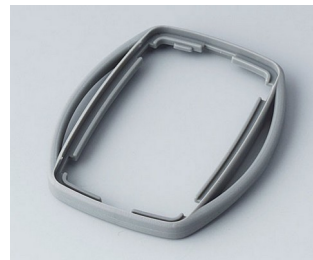
B9002758 Intermediate ring ES TPE volcano