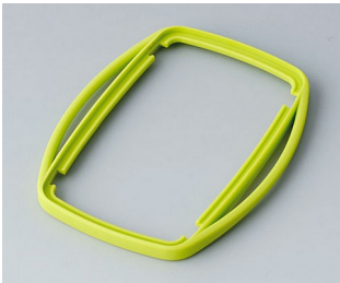
B9006754 Intermediate ring EL SEBS (TPE) green