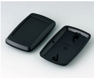
B9006806 Bottom and top part EL PMMA (IR) (UL 94 HB) black RAL 9005 78x48x20mm