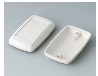
B9006827 Bottom and top part EL ABS (UL 94 HB) off-white RAL 9002 78x48x26mm