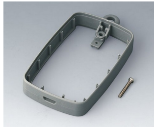
B9004778 Intermediate ring EM, Micro USB 5 P, B Type SMT SEBS (TPE) volcano