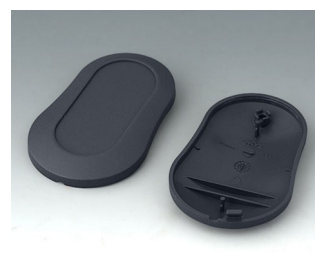
B9004908 Bottom and top part DM ABS (UL 94 HB) lava 70x44x16mm