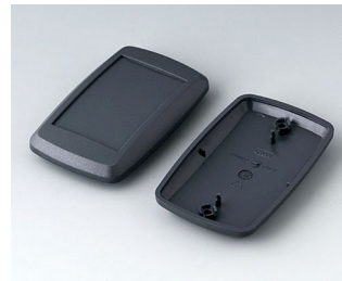
B9006808 Bottom and top part EL ABS (UL 94 HB) lava 78x48x20mm