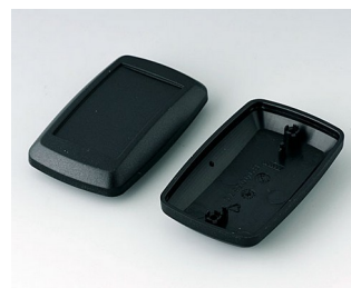
B9006826 Bottom and top part EL PMMA (IR) (UL 94 HB) black RAL 9005 78x48x26mm