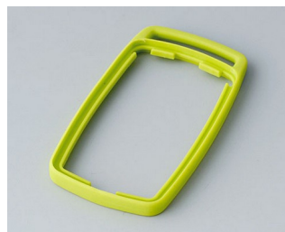
B9002704 Intermediate ring ES TPE green