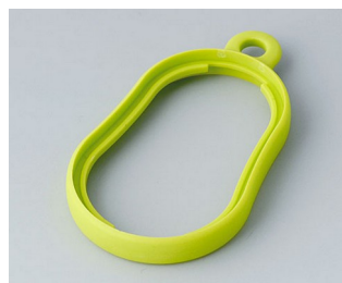
B9002354 Intermediate ring DS TPE green