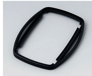
B9006756 Intermediate ring EL PMMA (IR) (UL 94 HB) black RAL 9005