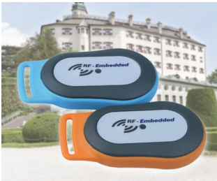
Mobile RFID information system