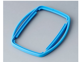
B9006755 Intermediate ring EL TPE blue