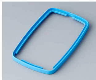
B9006785 Intermediate ring EL TPE blue