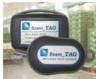
RFID sensor transponder and data logger