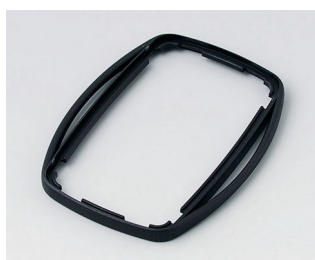
B9004756 Intermediate ring EM PMMA (IR) (UL 94 HB) black RAL 9005