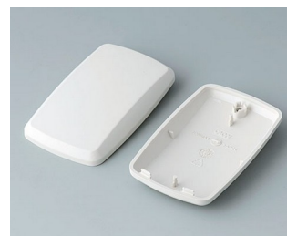
B9004857 Bottom and top part EM ABS (UL 94 HB) off-white RAL 9002 68x42x18mm