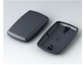
B9006858 Bottom and top part EL ABS (UL 94 HB) lava 78x48x20mm