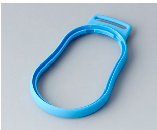
B9004305 Intermediate ring DM TPE blue