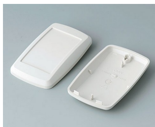
B9004807 Bottom and top part EM ABS (UL 94 HB) off-white RAL 9002 68x42x18mm