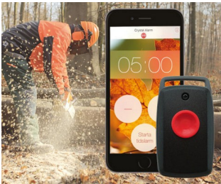
A personal alarm on your mobile phone

Dálkové ovladače. Zvláště v klinických a sociálních oblastech, stejně jako v domácnosti a průmyslu, např. Nouzové systémy, monitorovací a signalizační zařízení, rádiové dálkové ovládání atd. Přenosná USB zařízení, např. kompaktní měřicí přístroje s datovým protokolem jako datalogger stick IoT/IloT. Wearables.