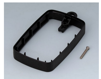
B9004786 Intermediate ring EM, high PMMA (IR) (UL 94 HB) black RAL 9005