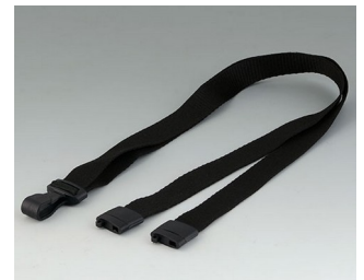
B9100073 Carrying strap, textile lanyard black 914x16mm