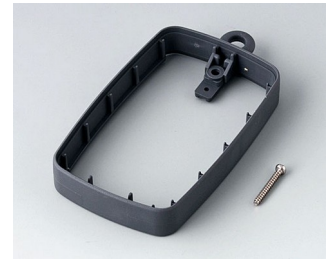
B9004782 Intermediate ring EM, high SEBS (TPE) lava