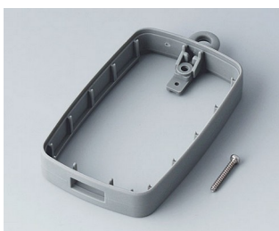
B9004798 Intermediate ring EM, USB type A TPE volcano