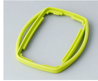
B9002754 Intermediate ring ES TPE green