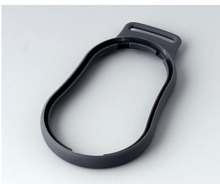
B9004302 Intermediate ring DM TPE lava