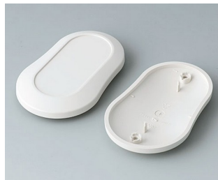
B9006907 Bottom and top part DL ABS (UL 94 HB) off-white RAL 9002 84x53x19mm