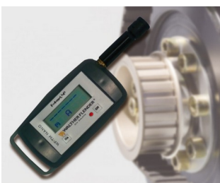
Tension meter for measuring belt pretension