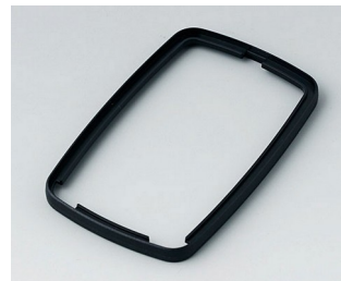
B9006786 Intermediate ring EL PMMA (IR) (UL 94 HB) black RAL 9005