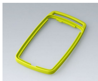
B9006704 Intermediate ring EL SEBS (TPE) green