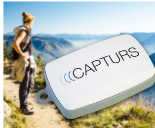
GPS tracking in real time