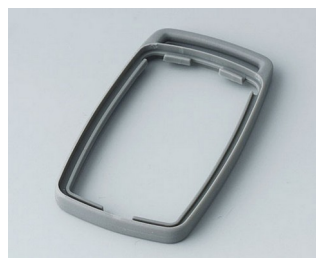
B9002708 Intermediate ring ES TPE volcano