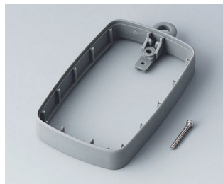
B9004788 Intermediate ring EM, high TPE volcano