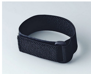
B9100033 Wrist strap black 280mm