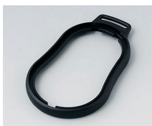
B9006306 Intermediate ring DL PMMA (IR) (UL 94 HB) black RAL 9005