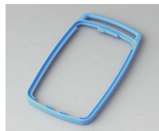
B9004705 Intermediate ring EM TPE blue