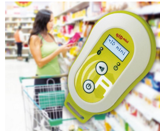
Mobile UHF RFID scanner