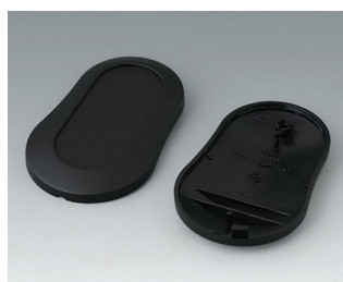
B9004906 Bottom and top part DM PMMA (IR) (UL 94 HB) black RAL 9005 70x44x16mm