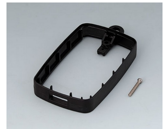
B9004796 Intermediate ring EM, USB type A PMMA (IR) (UL 94 HB) black RAL 9005