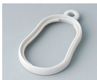
B9002357 Intermediate ring DS SEBS (TPE) off-white RAL 9002