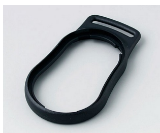
B9002306 Intermediate ring DS PMMA (IR) (UL 94 HB) black RAL 9005