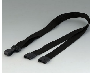
B9100073 Carrying strap, textile lanyard black 914x16mm

Subject to technical modification without notice. © by OKW Gehäusesysteme, Buchen/Germany.