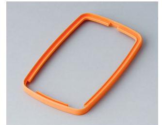
B9006783 Intermediate ring EL TPE orange