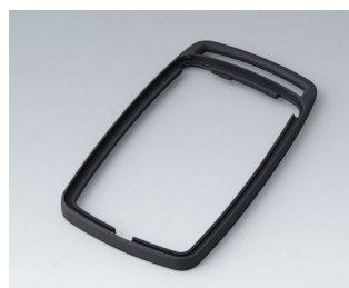
B9006702 Intermediate ring EL TPE lava