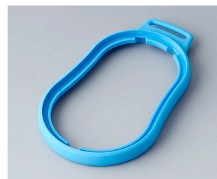
B9006305 Intermediate ring DL TPE blue