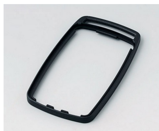
B9004706 Intermediate ring EM PMMA (IR) (UL 94 HB) black RAL 9005