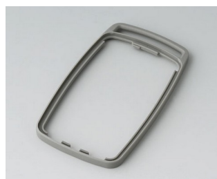
B9004708 Intermediate ring EM TPE volcano