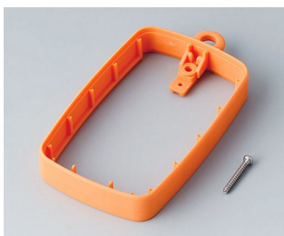
B9004783 Intermediate ring EM, high TPE orange