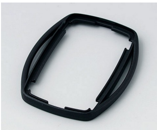
B9002756 Intermediate ring ES PMMA (IR) (UL 94 HB) black RAL 9005