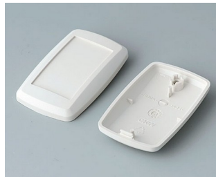
B9002807 Bottom and top part ES ABS (UL 94 HB) off-white RAL 9002 52x32x15mm