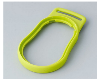
B9002304 Intermediate ring DS SEBS (TPE) green