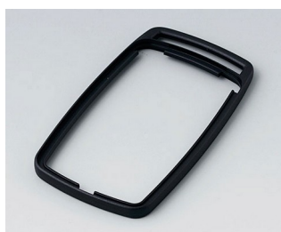
B9006706 Intermediate ring EL PMMA (IR) (UL 94 HB) black RAL 9005