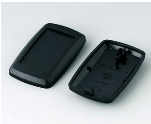
B9002806 Bottom and top part ES PMMA (IR) (UL 94 HB) black RAL 9005 52x32x15mm