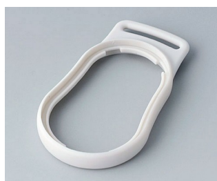
B9002307 Intermediate ring DS SEBS (TPE) off-white RAL 9002