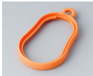
B9002353 Intermediate ring DS TPE orange