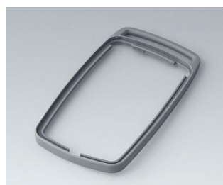
B9006708 Intermediate ring EL TPE volcano