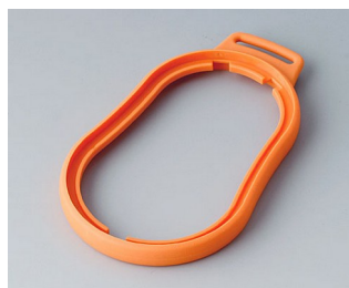
B9006303 Intermediate ring DL TPE orange