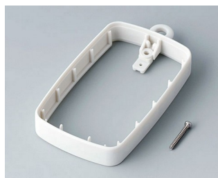
B9004787 Intermediate ring EM, high SEBS (TPE) off-white RAL 9002