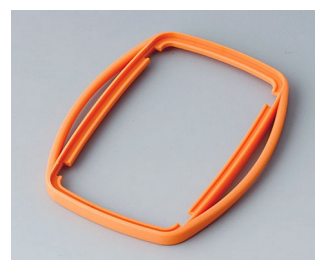
B9006753 Intermediate ring EL TPE orange