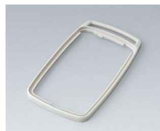
B9006707 Intermediate ring EL SEBS (TPE) off-white RAL 9002