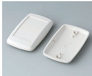
B9006807 Bottom and top part EL ABS (UL 94 HB) off-white RAL 9002 78x48x20mm