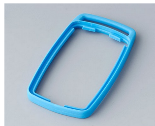
B9002705 Intermediate ring ES TPE blue