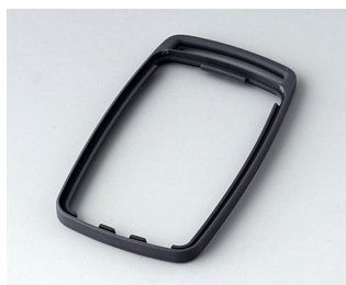
B9004702 Intermediate ring EM TPE lava