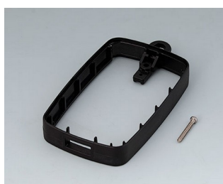
B9004796 Intermediate ring EM, USB type A PMMA (IR) (UL 94 HB) black RAL 9005