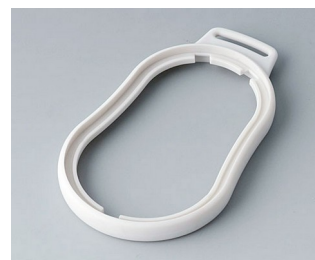
B9006307 Intermediate ring DL SEBS (TPE) off-white RAL 9002