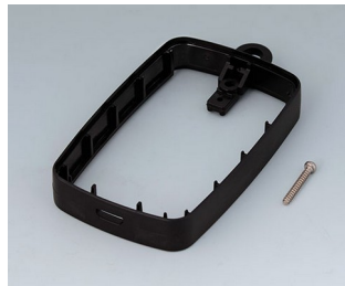
B9004776 Intermediate ring EM, Micro USB 5 P, B Type SMT PMMA (IR) (UL 94 HB) black RAL 9005