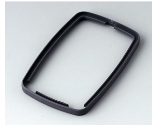
B9006782 Intermediate ring EL SEBS (TPE) lava