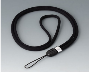
B9100063 Carrying strap, textile lanyard black 860mm