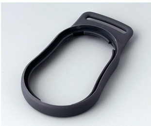
B9002302 Intermediate ring DS TPE lava