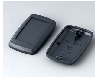
B9002808 Bottom and top part ES ABS (UL 94 HB) lava 52x32x15mm