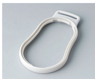
B9004307 Intermediate ring DM SEBS (TPE) off-white RAL 9002