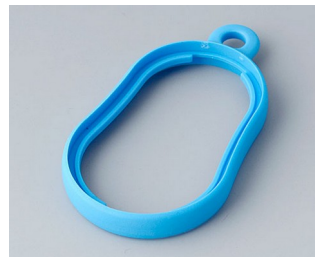
B9002355 Intermediate ring DS TPE blue