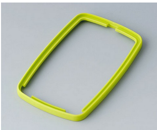
B9006784 Intermediate ring EL SEBS (TPE) green