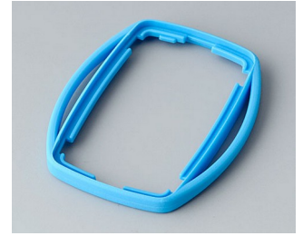
B9002755 Intermediate ring ES TPE blue