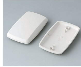
B9006857 Bottom and top part EL ABS (UL 94 HB) off-white RAL 9002 78x48x20mm