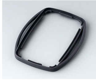
B9004752 Intermediate ring EM TPE lava