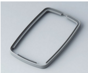
B9006788 Intermediate ring EL TPE volcano