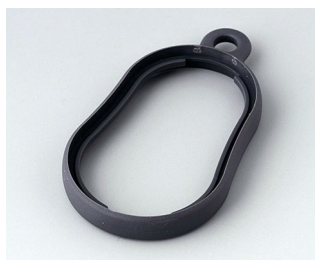
B9002352 Intermediate ring DS TPE lava