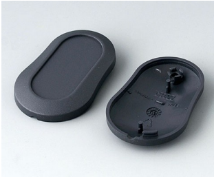
B9002908 Bottom and top part DS ABS (UL 94 HB) lava 51x32x13mm