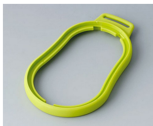
B9006304 Intermediate ring DL TPE green