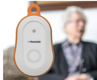
LoRa GPS tracker with alarm button