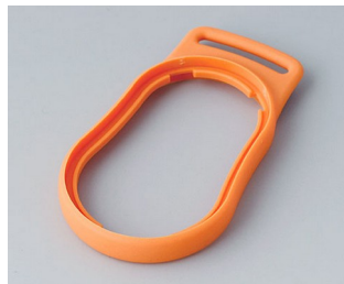
B9002303 Intermediate ring DS SEBS (TPE) orange