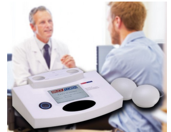
Multiple analytical resonance system