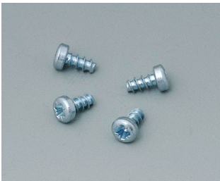
B5111201 Set of screws