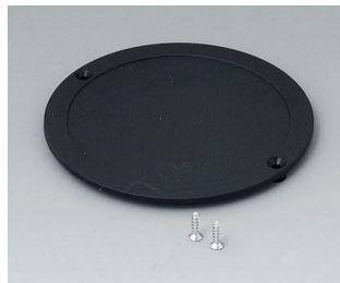
B5011859 Battery compartment lid ABS (UL 94 HB) black RAL 9005