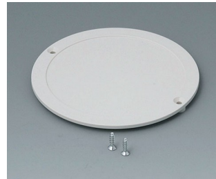
B5011847 Lid ABS (UL 94 HB) off-white RAL 9002