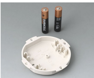
B5111107 Battery compartment, 2 x AAA ABS (UL 94 HB) off-white RAL 9002