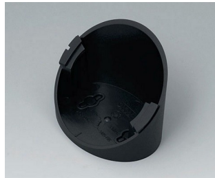
B5011319 Base 55° ABS (UL 94 HB) black RAL 9005