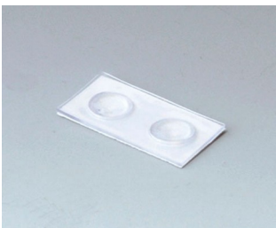
A9207150 Anti-slide feet 6.5 x 2 mm transparent