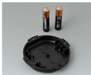
B5111109 Battery compartment, 2 x AAA ABS (UL 94 HB) black RAL 9005