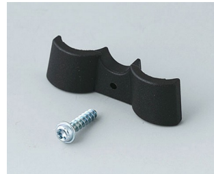
A9166003 Battery holder, 2 x AAA PA 6 (UL 94 HB) black RAL 9005