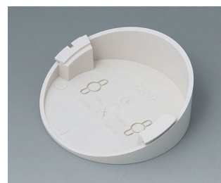
B5011217 Base 30° ABS (UL 94 HB) off-white RAL 9002