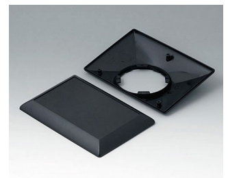
B5017209 Bottom and top part E160 F ABS (UL 94 HB) black RAL 9005 160x110x38mm