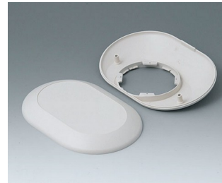
B5015207 Bottom and top part O160 F ABS (UL 94 HB) off-white RAL 9002 160x110x38mm