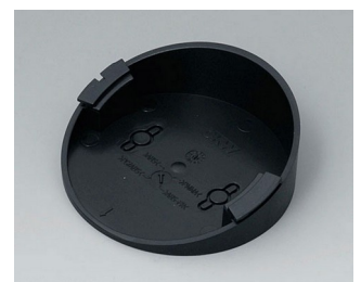
B5011219 Base 30° ABS (UL 94 HB) black RAL 9005