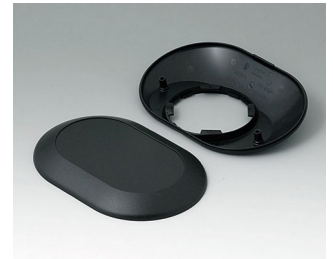
B5015209 Bottom and top part O160 F ABS (UL 94 HB) black RAL 9005 160x110x38mm