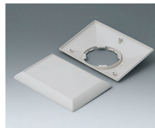
B5017207 Bottom and top part E160 F ABS (UL 94 HB) off-white RAL 9002 160x110x38mm