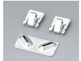
A9190002 Set of battery clips, 2xN/2xAA/2xAAA Steel tin-plated