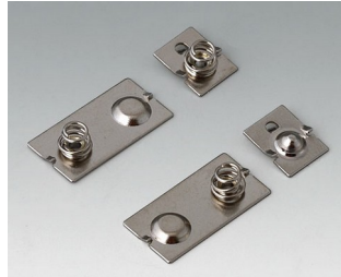
A9190024 Set of battery clips, 3 x AAA Steel nickel-plated