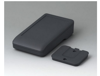
A9005218 DATEC-COMPACT S ASA+PC (UL 94 V-0) lava 136x74x32mm IP 41