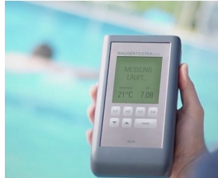
Electronic pool tester