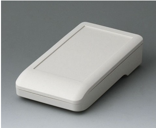
A9005107 DATEC-COMPACT S ASA+PC (UL 94 V-0) off-white RAL 9002 136x74x32mm IP 65