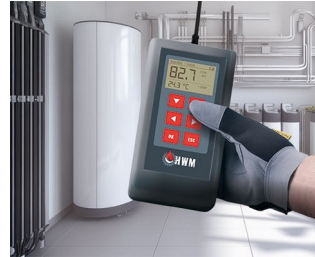
Measuring device for heating water