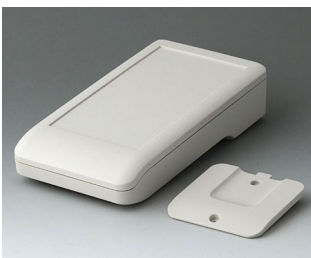
A9006207 DATEC-COMPACT M ASA+PC (UL 94 V-0) off-white RAL 9002 172x92x39mm IP 65