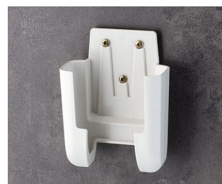
A9106627 Holder M ASA+PC (UL 94 V-0) off-white RAL 9002