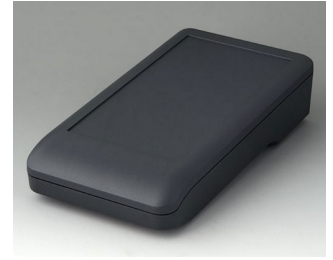
A9007118 DATEC-COMPACT L ASA+PC (UL 94 V-0) lava 206x110x47mm IP 41