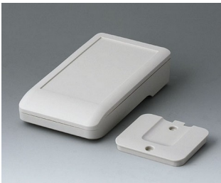
A9005207 DATEC-COMPACT S ASA+PC (UL 94 V-0) off-white RAL 9002 136x74x32mm IP 65