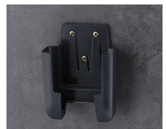
A9106628 Holder M ASA+PC (UL 94 V-0) lava