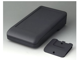
A9007218 DATEC-COMPACT L ASA+PC (UL 94 V-0) lava 206x110x47mm IP 41