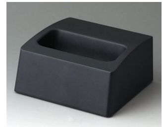
A9106508 Station M ASA+PC (UL 94 V-0) lava