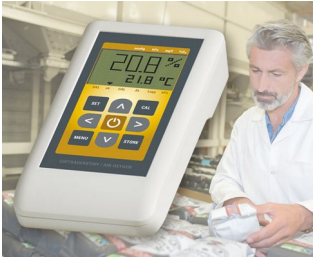
Atmospheric oxygen measuring unit

Mobile data recording, measuring and control technology, control technology, medical and laboratory technology, environmental technology, outdoor, smart factory, industry 4.0, etc.