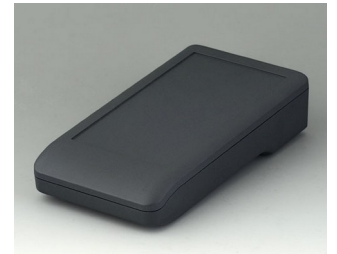
A9006118 DATEC-COMPACT M ASA+PC (UL 94 V-0) lava 172x92x39mm IP 41