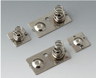
A9190023 Set of battery clips, 3 x AA Steel nickel-plated