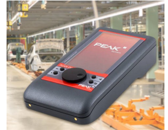
Mobile diagnostic device for CAN and CAN FD buses