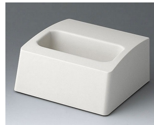
A9106507 Station M ASA+PC (UL 94 V-0) off-white RAL 9002