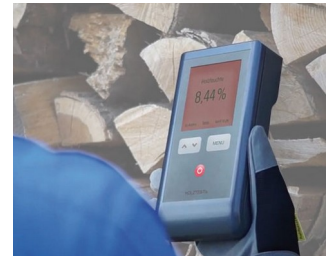
Wood moisture measuring device