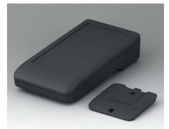
A9006218 DATEC-COMPACT M ASA+PC (UL 94 V-0) lava 172x92x39mm IP 41