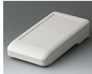
A9006117 DATEC-COMPACT M ASA+PC (UL 94 V-0) off-white RAL 9002 172x92x39mm IP 41