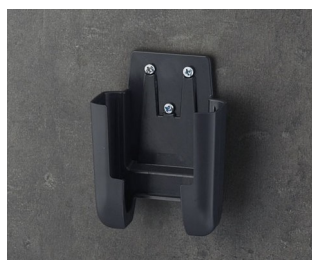
A9105628 Holder S ASA+PC (UL 94 V-0) lava