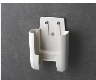
A9105627 Holder S ASA+PC (UL 94 V-0) off-white RAL 9002