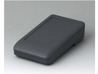
A9005118 DATEC-COMPACT S ASA+PC (UL 94 V-0) lava 136x74x32mm IP 41