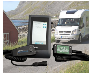
System for leak detection in leisure vehicles