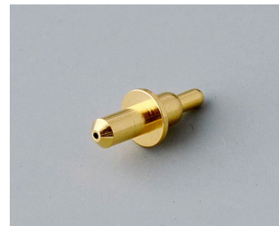
A9193031 Spring contact gold-plated