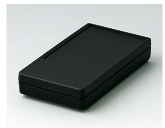
A9070119 DATEC-POCKET-BOX S ABS (UL 94 HB) black RAL 9005 85x46x16mm IP 54