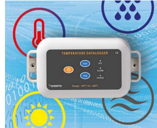
Data logger e.g. for temperature