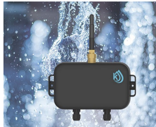
Water Level Monitoring