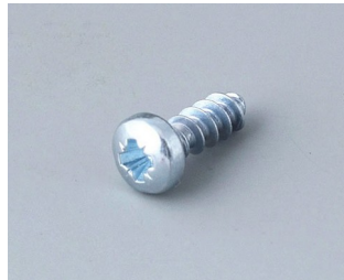
A0308031 Self-tapping screws 3 x 8 mm (PZ1)