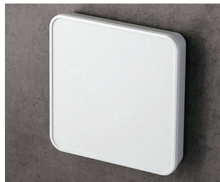
C6404107 SMART-PANEL S114 ASA+PC (UL 94 V-0) traffic white RAL 9016 114x114x21.3mm IP 40