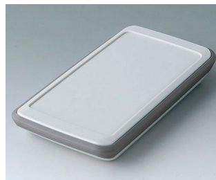
B5403317 SLIM-CASE M, Vers. VI ASA+PC (UL 94 V-0) off-white RAL 9002 148x74x22mm IP 54