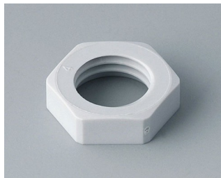
C2312117 Counternut M12x1.5 PA 6 light grey RAL 7035