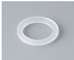
C2312126 Sealing ring for external thread M12x1.5 PE natural-coloured