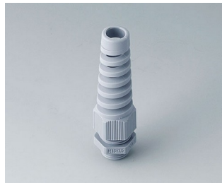
C2316518 Cable gland M16x1.5, bending protection PA 6 silver grey RAL 7001 IP 68 opt.