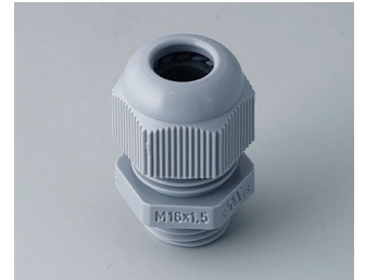
C2316418 Cable gland M16x1.5 PA 6 silver grey RAL 7001 IP 68 opt.