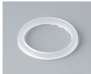
C2316126 Sealing ring for external thread M16x1.5 PE natural-coloured