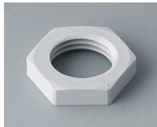
C2316117 Counternut M16x1.5 PA 6 light grey RAL 7035