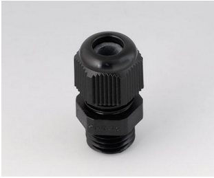
C2312419 Cable gland M12x1.5 PA 6 black RAL 9005 IP 68 opt.