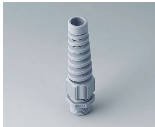
C2320518 Cable gland M20x1.5, bending protection PA 6 silver grey RAL 7001