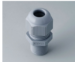
C2316618 Cable gland M16x1.5 PA 6 silver grey RAL 7001 IP 68 opt.