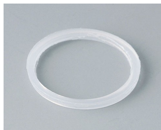
C2320126 Sealing ring for external thread M20x1.5 PE natural-coloured