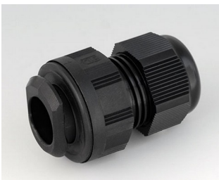
C2320719 Quick fix cable gland, M20 PA 6 black RAL 9005