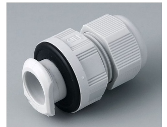
C2320717 Quick fix cable gland, M20 PA 6 light grey RAL 7035