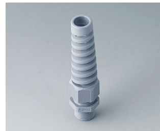
C2320528 Cable gland M20x1.5, bending protection PA 6 silver grey RAL 7001