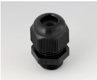
C2316419 Cable gland M16x1.5 PA 6 black RAL 9005 IP 68 opt.