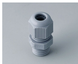
C2312418 Cable gland M12x1.5 PA 6 silver grey RAL 7001