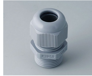
C2320418 Cable gland M20x1.5 PA 6 silver grey RAL 7001