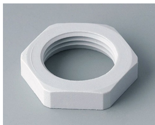
C2320117 Counternut M20x1.5 PA 6 light grey RAL 7035