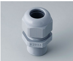
C2320428 Cable gland M20x1.5 PA 6 silver grey RAL 7001