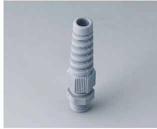
C2312518 Cable gland M12x1.5, bending protection PA 6 silver grey RAL 7001 IP 68 opt.