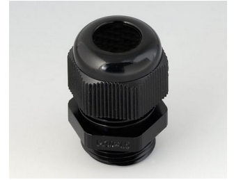
C2320419 Cable gland M20x1.5 PA 6 black RAL 9005